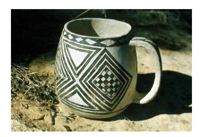
Mug - http://www.nps.gov/meve/learn/education/artifactgallery mug.htm

Explain how the artifact demonstrates the ways Ancestral Pueblo people used natural resources from the region to meet their fundamental human needs.